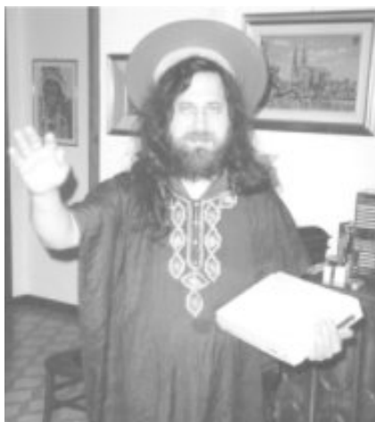
Stallman dressed as St. Ignucius.

"I am St. Ignucius of the Church of Emacs," says Stallman, raising his right hand in mock-blessing. "I bless your computer, my child."